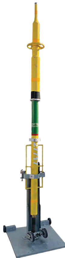
Ground Storage Rack HALL P/N: AP1707-0201