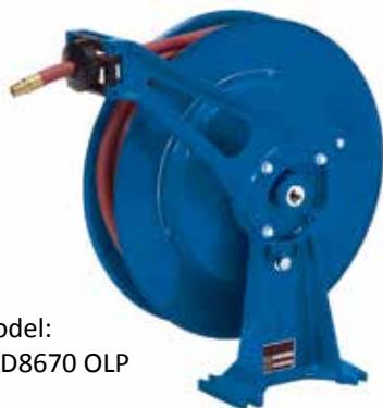
Model: HTD8670 OLP