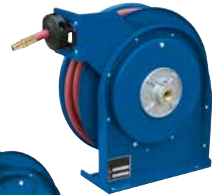
Model: HT4425 OLP