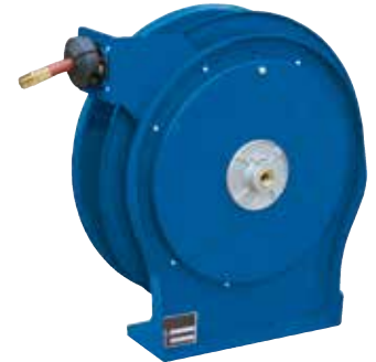
Model: HTB5850 OLP