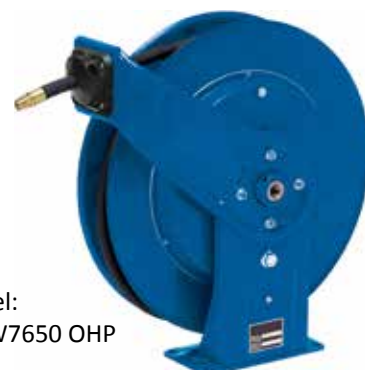
Model: HTPW7650 OHP