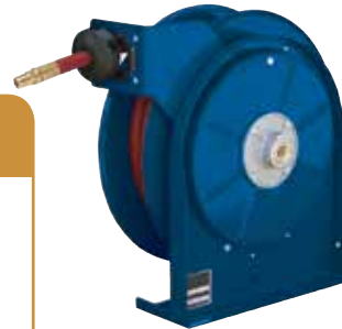
Model: HT5635 OLP