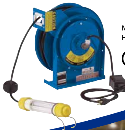
Model: HTL 4050 162 2